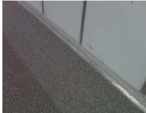
Completed cove with profile

PLASTI CHEMIE Produktionsgesellschaft mbH